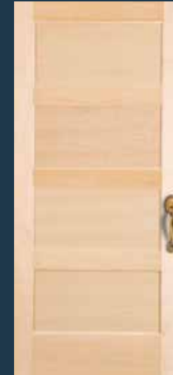
7284 Shown in maple