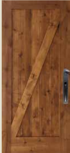
49852 Shown in knotty alder