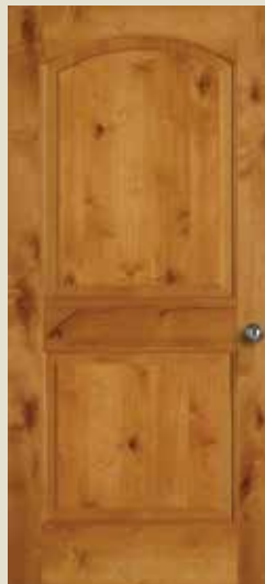
7465 Shown in knotty alder