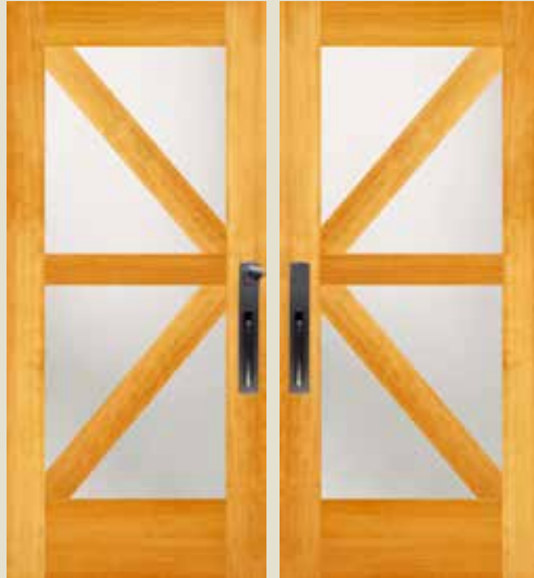
49865* (LEFT), 49866* (RIGHT),