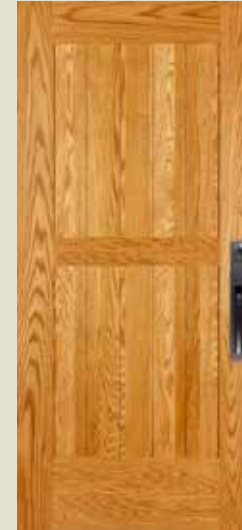
49842 Shown in oak