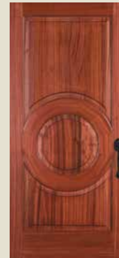
4968 Shown in sapele mahogany