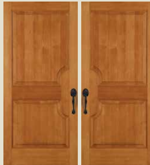
4962* (LEFT), 4963* (RIGHT),