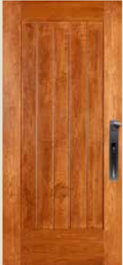
49841 Shown in cherry