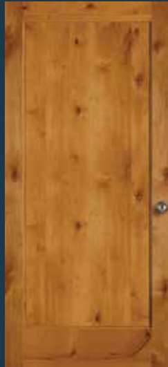
7220 Shown in knotty alder