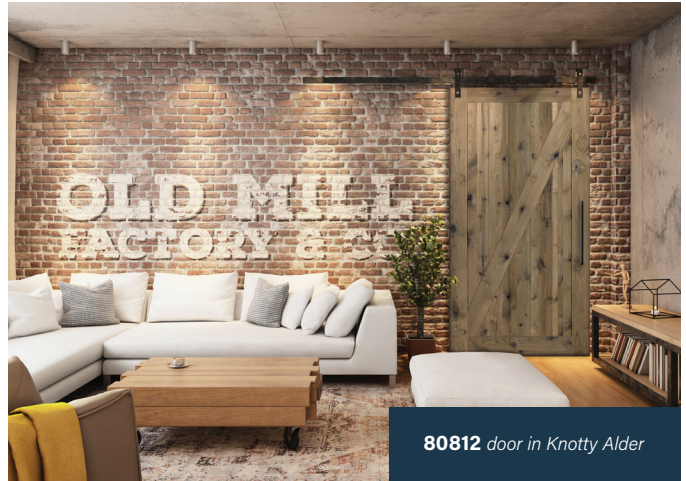
80812 door in Knotty Alder