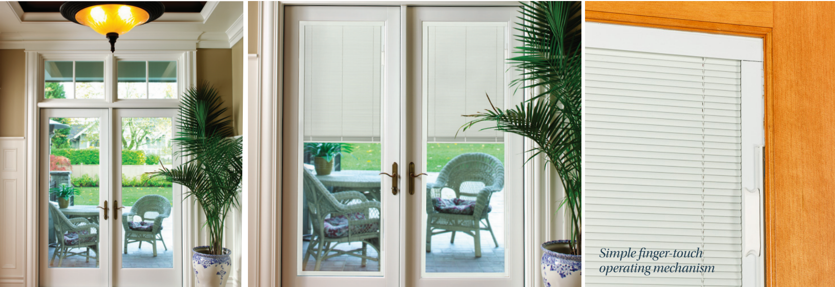
Simple finger-touch operating mechanism

Simpson design #7102 French door with internal blinds lets you control the view and privacy at the touch of a finger. The easy operation allows you to tilt the blinds open or closed, plus you can raise or lower the blind. And since the blinds are protected on both sides by glass, they never collect dust or become damaged. No more cords to pull and no more blinds banging against the door each time you open it. Just perfect control and a beautiful appearance.