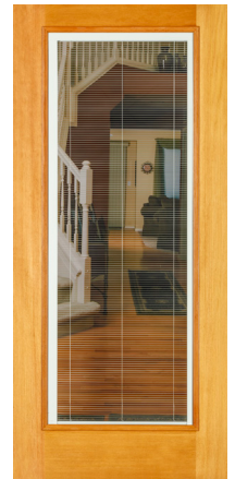
Exterior View with Blinds Tilted