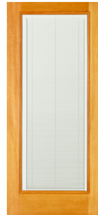
Exterior View with Closed Blind