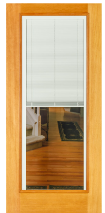
Exterior View with Blinds Open Half Way